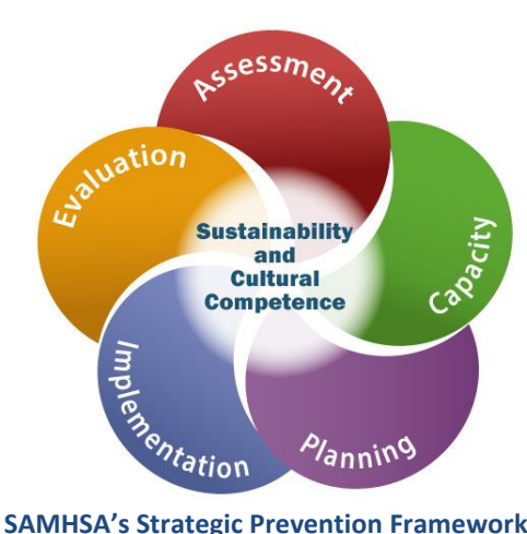
SAMHSA's Strategic Prevention Framework

The Strategic Prevention Framework model was adopted by the Drug Policy Board in 2005 to guide substance abuse prevention planning in the state.