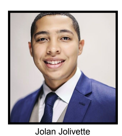
Governor's Office of Disability Affairs, Assistant Director

Governor's Office of Disability Affairs, Executive Director