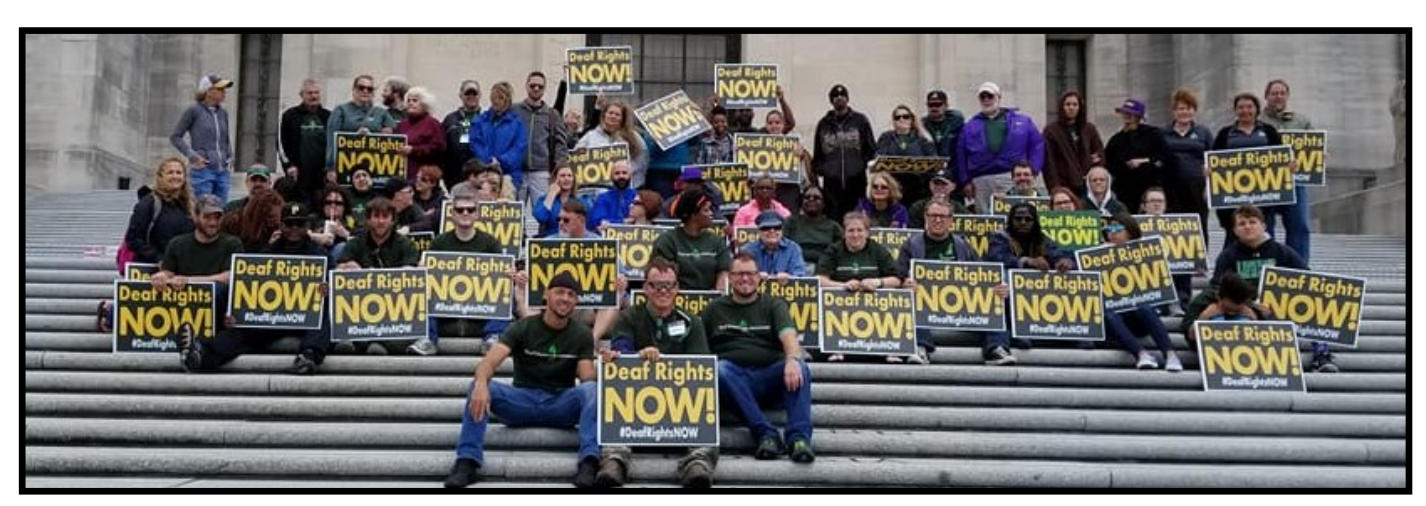
Autism Awareness Events