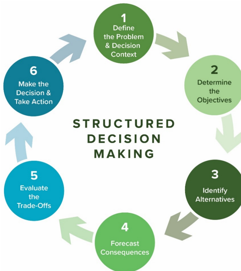
Figure 3 The Six-Step SDM Process

The planning process for developing the Final Climate Report will be grounded in a Structured Decision Making (SDM) approach. In basic terms, SDM is “a formalization of common sense for decision problems which are too complex for informal use of common sense.” 1 SDM is an approach that integrates science and policy to break down complex decisions and identify solutions that achieve the desired ends (referred to as “fundamental objectives” in SDM) in a manner that is explicit and transparent. SDM is not a prescriptive approach to problem solving, but rather it encompasses broad methods that rely on clearly articulating fundamental objectives and analyzing potential impacts to those objectives using data-driven analysis. See Figure 5 for the six steps of the iterative SDM process. The charges to the Sector Committees and Advisory Groups will support the SDM process and will help the Task Force make informed, data-driven decisions on which strategies to pursue to best meet the emission reduction goals and other desired outcomes for Louisiana.